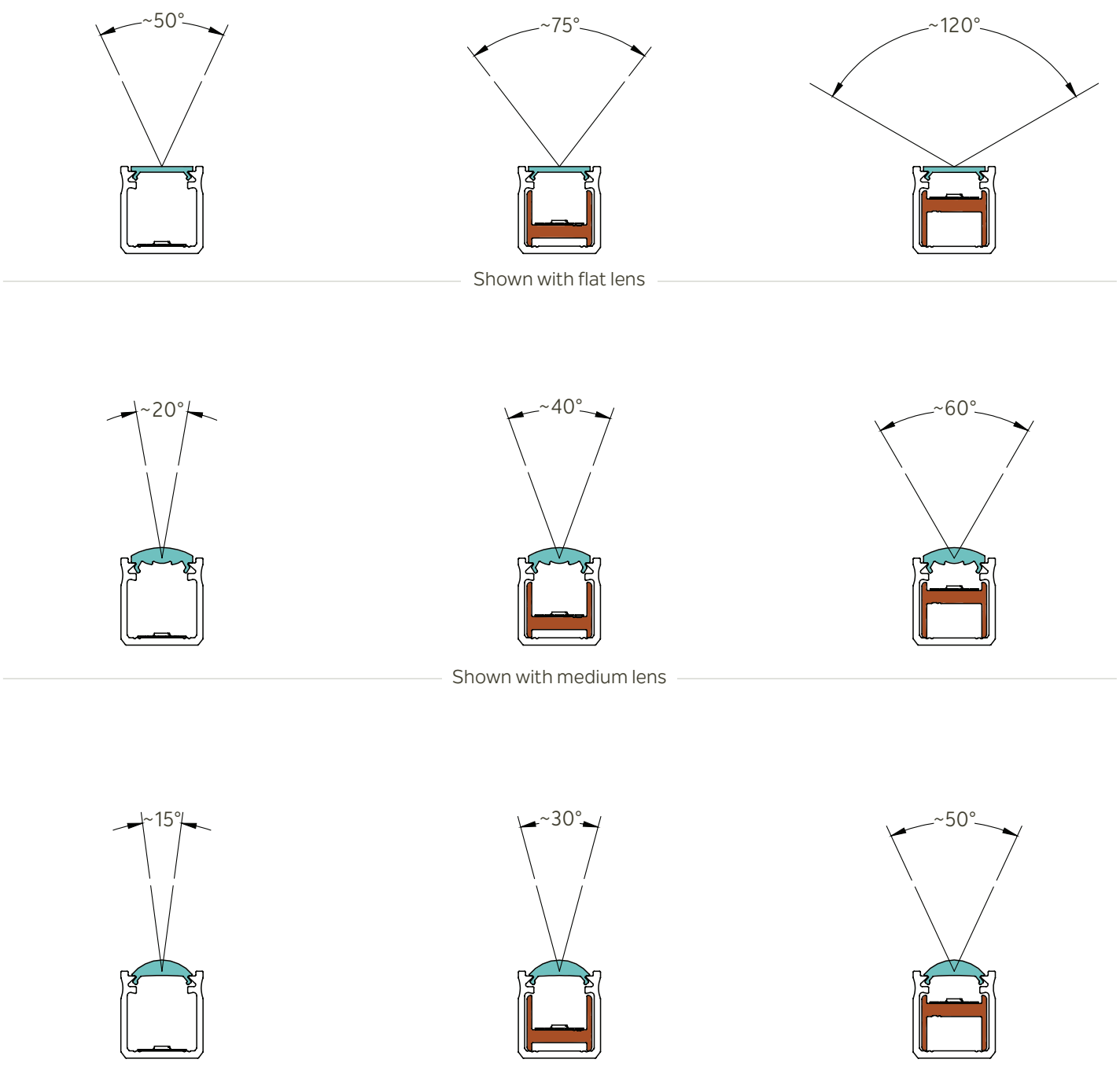
Shown with narrow lens

The Beam Spread Adjustment accessory (1TEA1DWADJ) can be inserted at the base of the channel, or inverted to elevate the LED placement to two different heights. The illustrations below depict the deep well channel without the adjustment accessory, as well as the effect achieved once inserted.